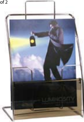
Signature Two has two pockets, 8.5" x 11" literature: SIG-2