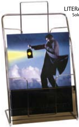
Signature One has three pockets, 8.5" x 11" literature : SIG-1