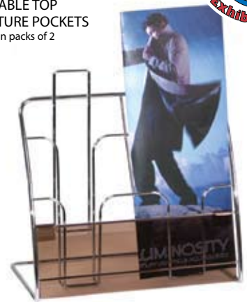
Signature Four has four pockets 4.25" x 11" literature: SIG-4