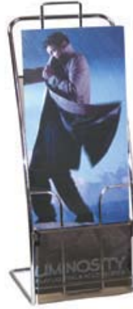
Signature Three has three pockets 4.25" x 11" literature: SIG-3